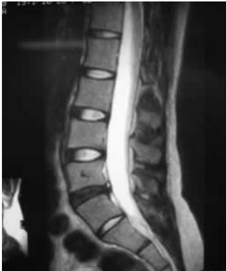
Notice the dark disc, which means loss of water and degenerative disc disease.

Typically, patients will complain of significant chronic back pain and be in a typical age group for the problem. X-rays may show loss of disk height on the films along with bone changes due to concomitant arthritis. If the disk height loss is severe enough, nerve roots can be indirectly pinched as they try to get out from the spine, and patients may have symptoms in their lower extremities as well such as sciatica.